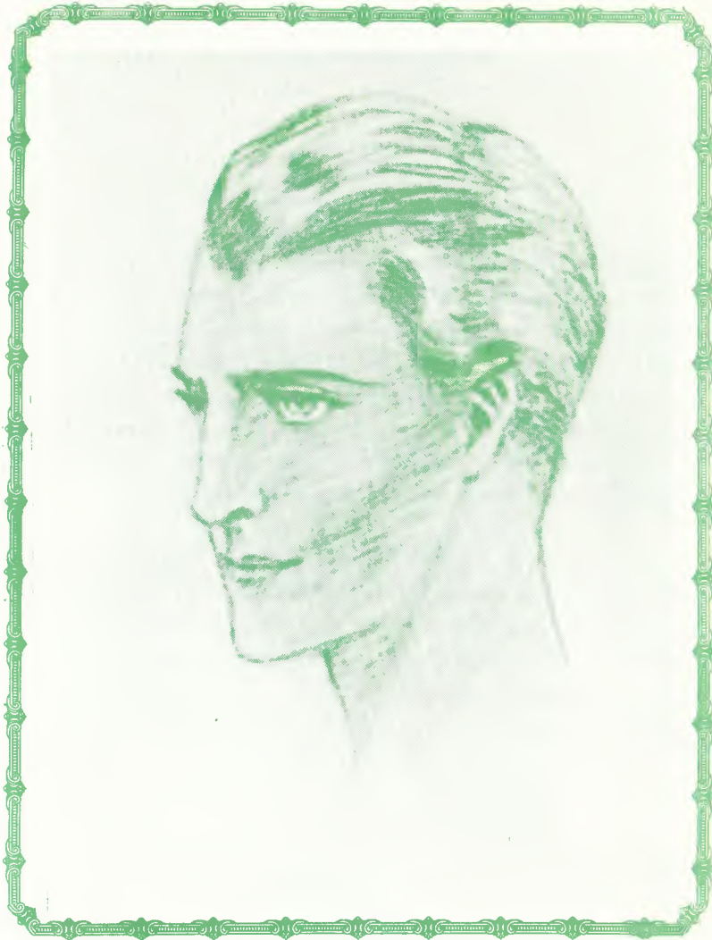
THE BELOVED ASCENDED MASTER HILARION

Healing is the Science of Love. In the work of healing, man must conceptualize and accept (think and feel) God to be the Doer, the Doing, and the Deed. In ancient days when one could go to the Healing Temple, it would be a time of purification and restoration on both the spiritual and physical plane. The Priest-Healer recognized God as the healing in him as well as the healing through him , accomplished by assisting the patient* to do likewise. The actual healing took place when God coming through the Healer connected strongly with God in the one to be healed. Beloved Master Jesus worked this way, as He had a strong force of God pouring through Him, as well as a powerful ability to call forth (invoke) the God in the one needing healing. In fact, He called back Lazarus this way. And as Beloved Jesus affirmed, every man, woman and child has the same potential to heal if they allow the Christ Presence in themselves to call forth and connect with the Christ Presence in the body of another. This connection, or oneness, will allow the specifically qualified energy of healing to flow forth and do the actual atomic and molecular restoration needed for healing. This fulfills the Christian teaching of redemption (healing) through atonement (at-one-ment).