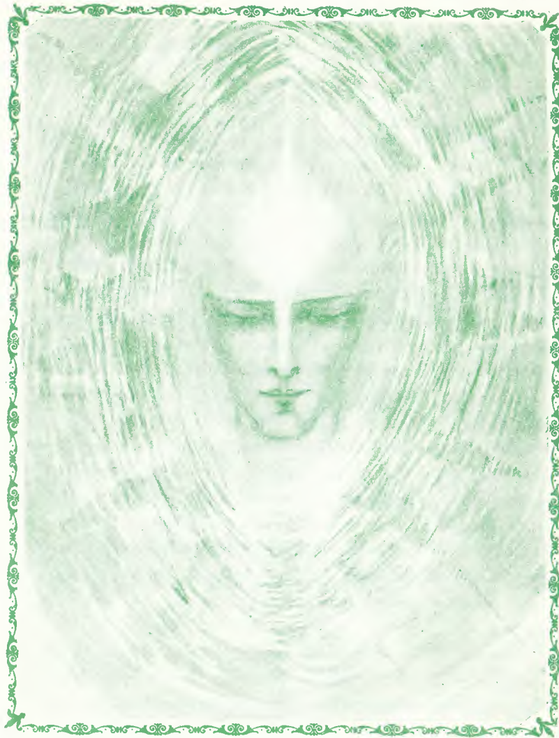
Master Hilarion showing himself in Deva form.

Each atom in the physical plane has a Divine Plan or a natural state which it will revert back to if given the right vibratory level or vibratory thrust. To create these vibratory levels, Healers will use the pressure of their own Three-fold Flame and its aura in ever expanding, upward rushing force of vibration and consciousness. They will, as well, tap into this same upward rushing force of the Christ Presence of the one being healed. Healing is the science of changing vibratory levels, or loving free man's vehicles of expression. Scientists so far leave out mankind when they deal with the 'cold hard facts' of physics, yet, in truth, man is the